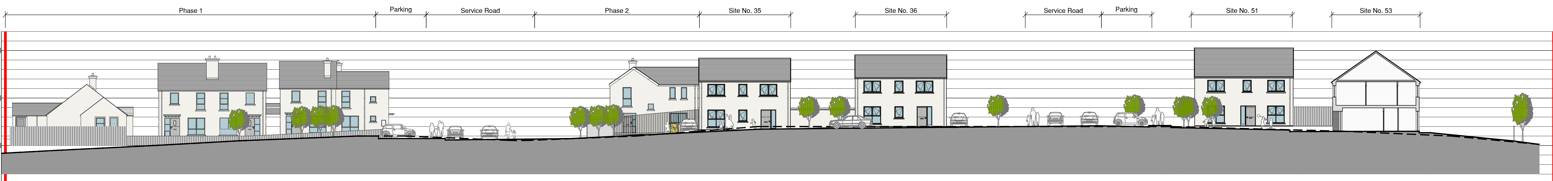
Site Section D-D Existing Ground Levels - - - - - Proposed Ground Levels ——— Application Boundary ———